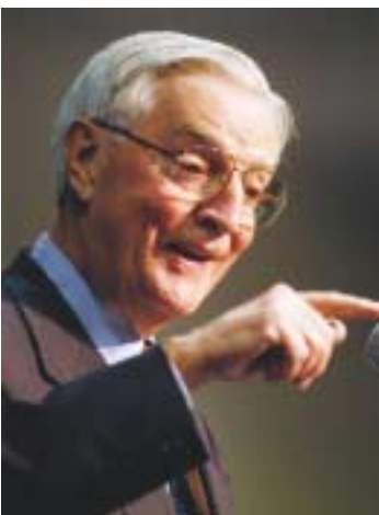
Walter F. Mondale

The Attorney General and some members of Congress have proposed (and legislation has been introduced) to widen the use of so-called "administrative subpoenas" as a weapon in the battle against terrorism.