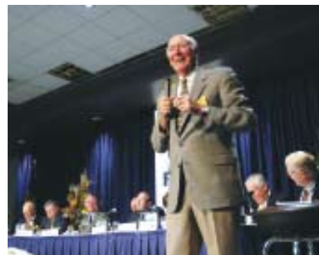
Governor Cecil D. Andrus welcomes the conferees.

We are far from consensus, politically or legally, about many of the domestic policy issues that arise from the threats presented by terrorism.