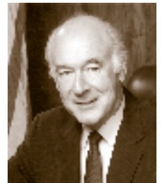
Cecil D. Andrus

Our ways of defining freedom, secrecy, security, and liberty are, as was suggested at the outset of this paper, not new debates in America. The current debates are variations on a recurring theme. In times of national crisis, faced with a frightful enemy and uncertain circumstances, the delicate balances that moderate among our occasionally conflicting values are upset. Abraham Lincoln suspended habeus corpus during the darkest days of the American Civil War. German language books were banned and the right to free speech infringed in many states during the First World War. The widespread raids against suspected anarchists and their foreign influence, ordered by Attorney General A. Mitchell Palmer in 1919 and 1920, are a sobering reminder of what unchecked power in the hands of federal law enforcement can mean. Japanese-Americans by the thousands, most of them American citizens, were interned during a time of world war in the 1940's. And a Senator from Wisconsin by the name of McCarthy gave his name to an American age by suggesting that “un-American” behavior was a threat to the nation's security.