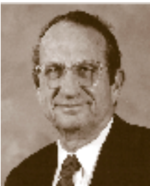
Dr. John Deutch

Deutch advocated one national system, combining national security issues with law enforcement: