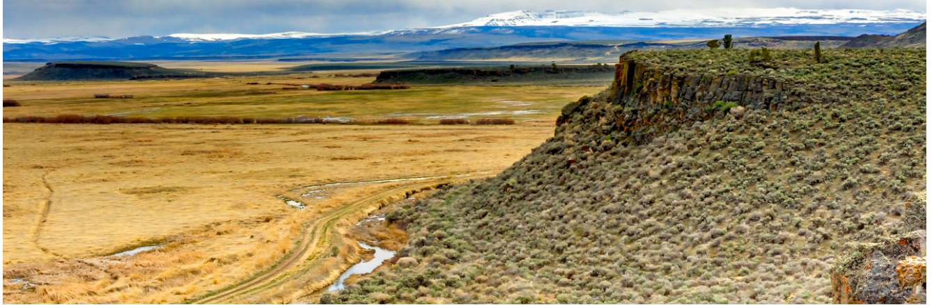
Buena Vista Overlook, Malheur National Wildlife Refuge