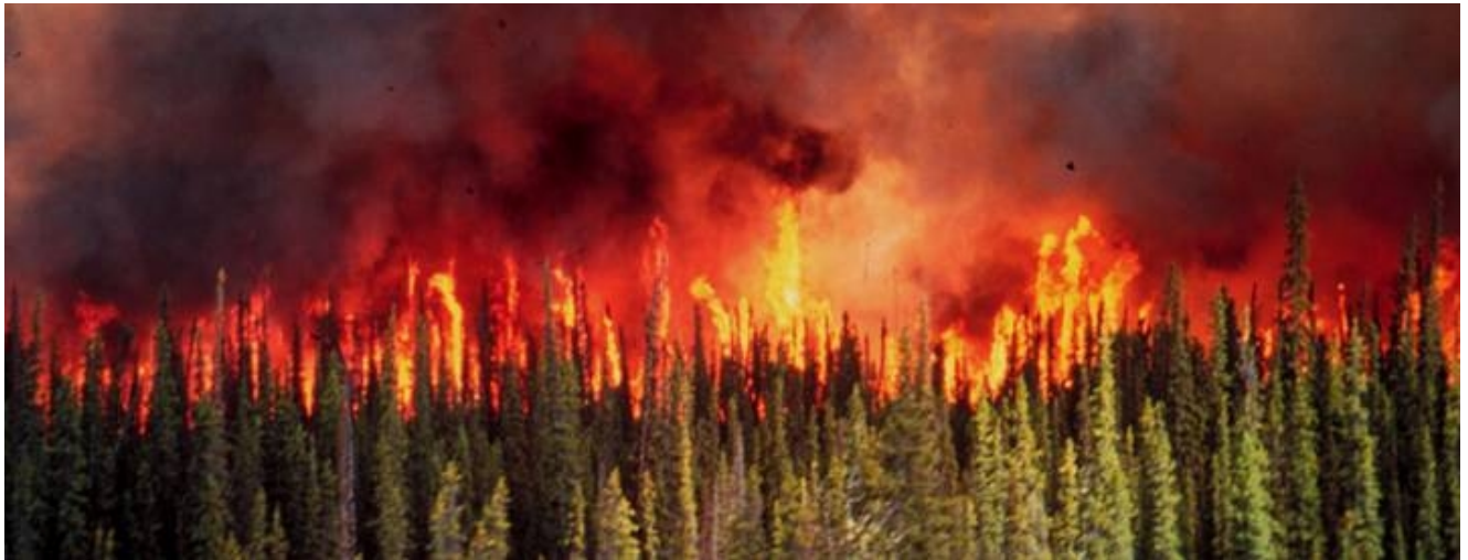
Crown Fire, Forest Service Northern Region, Missoula, MT

At the same time, the congressman acknowledged the local versus national tension in federal land management and urged federal land managers to pay closer attention to the needs of local communities, which are often expressed through their county commissioners. (See discussion below).