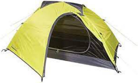
1 Person Tent