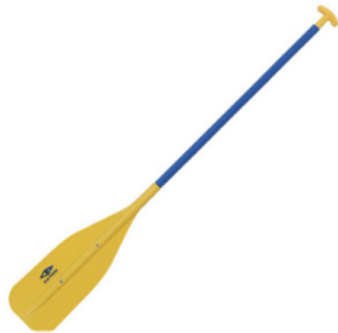
Raft Paddle - Crew