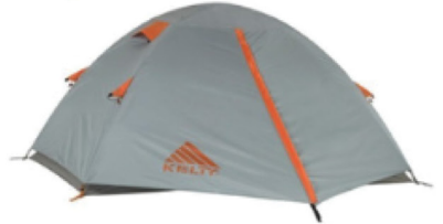
3 Person Tent