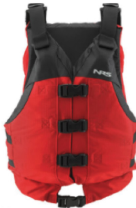
Type V Personal Floatation Device - Adult or Plus