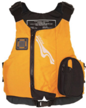
Type III Personal Floatation Device