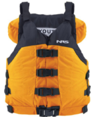
Type V Personal Floatation Device - Youth