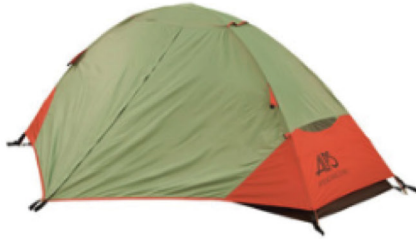
2 Person Tent