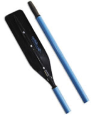
Oar - 7' 8' 9' 10'