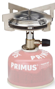
Single Burner Stove