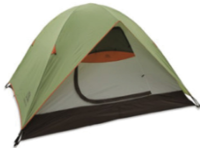
6 Person Tent