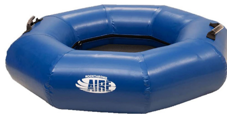
Deluxe River Tube