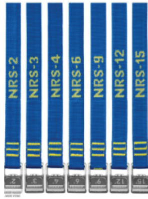
NRS Cam Strap Bag (4 of each: 2', 4', 6', 9' and 12')