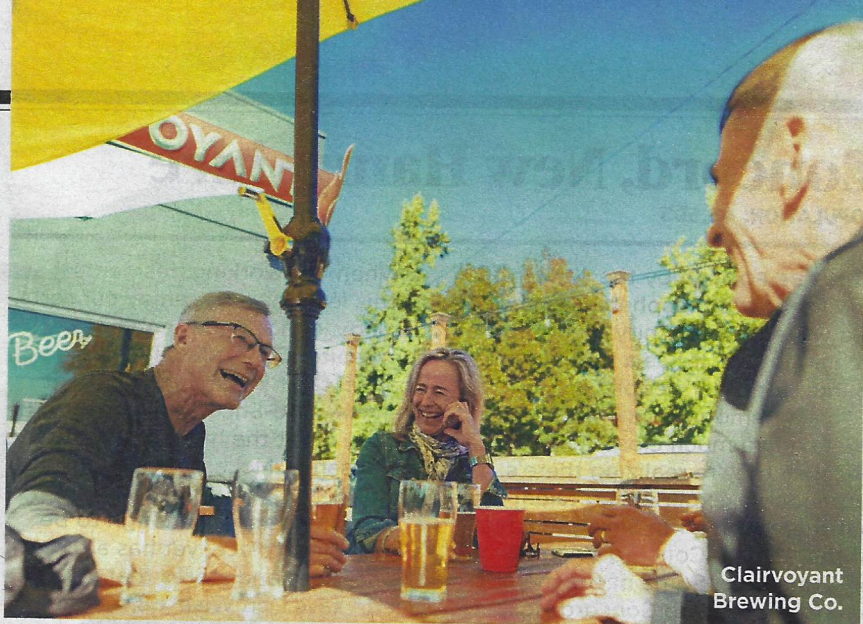
Clairvoyant Brewing Co.