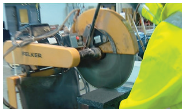
Worker cutting masonry block on a stationary masonry saw equipped with integrated water delivery system that continuously feeds water to the blade. Note water supply hose attached to top of shroud around blade.

Respiratory protection is not required for work with stationary masonry saws regardless of task duration.