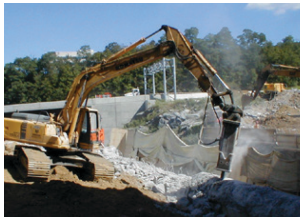
Excavator equipped with an enclosed cab and hoe-ram demolishing a concrete wall.

NOTE: When the operator exits the enclosed cab and is no longer actively performing the task, the operator is considered to have stopped the task. However, if other abrading, fracturing, or demolition work is performed by other heavy equipment and utility vehicles in the area while an operator is outside the cab, that operator is considered to be an employee “engaged in the task” and must be protected by the application of water and/or dust suppressants.