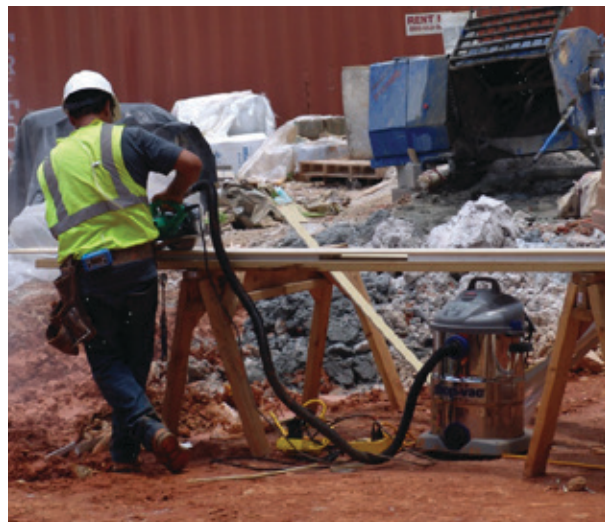
Worker cutting fiber-cement board outdoors using a handheld power saw and dust collection system. The dust collection system consists of the shroud on the saw, hose, and dust collector positioned between the saw horses.

Respiratory protection is not required for work outdoors with specialty handheld power saws while cutting fiber-cement board regardless of task duration.