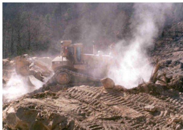
Earthmoving using a dozer equipped with enclosed operator cab.

Respiratory protection is not required for work with heavy equipment when it is operated from within an enclosed cab, or when water or other dust suppressants are used, regardless of task duration.