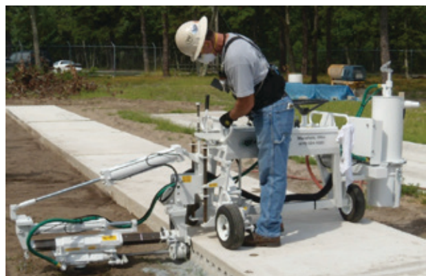
Worker drilling horizontal holes in concrete slab with a dowel drilling rig. The shroud surrounds the drill steel where it enters the concrete and the dust collector is the canister on the right. Worker is wearing respiratory protection.

Respiratory protection with a minimum APF of 10 is required for all work with dowel drilling rigs for concrete regardless of task duration.