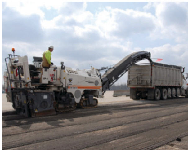
Milling machine milling asphalt road and loading debris into haul truck.

Respiratory protection is not required for work with small drivable milling machines (less than half-lane) regardless of task duration.