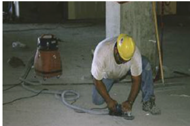
Worker grinding concrete floor with grinder attached to dust collector (background).

When using handheld grinders indoors or in enclosed areas (areas where airborne dust can buildup, such as a structure with a roof and three walls), employers must provide additional exhaust as needed to minimize the accumulation of visible airborne dust. See the section on Indoors or Enclosed Areas for more information.