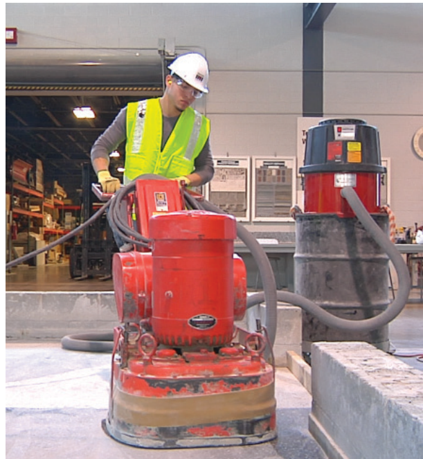
Worker milling granite floor indoors with milling machine and dust collection system (background).

Respiratory protection is not required for work with walk-behind milling machines and floor grinders regardless of task duration.