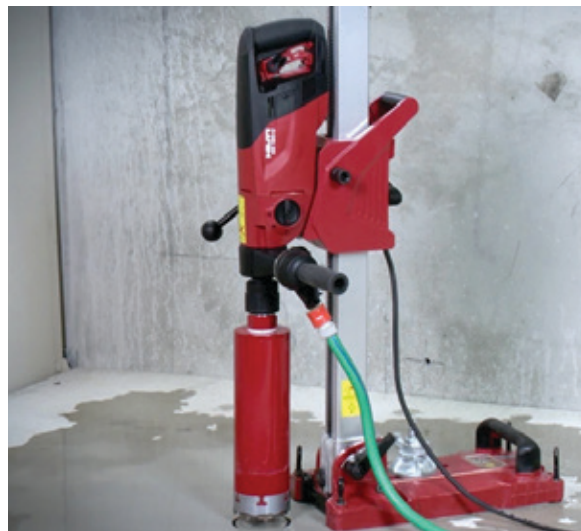
A rig-mounted core drill with an integrated water delivery system.

Respiratory protection is not required for work with rig-mounted core saws or drills regardless of task duration.