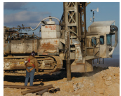
Vehicle-mounted drilling rig using water on the drill bit. The enclosed operator’s cab is on the right.

Respiratory protection is not required for work with vehicle-mounted drilling rigs regardless of task duration.