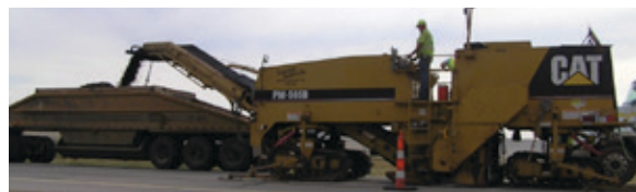
Milling machine milling asphalt road and loading debris into a haul truck.

Respiratory protection is not required for work with large drivable milling machines (half-lane or larger) regardless of task duration.