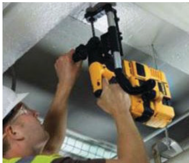
Worker drilling into concrete with a rotary hammer equipped with shroud and dust collection system. Note the shroud around drill bit, silver and black hose, and dust collector are attached conveniently to the drill.

The equipment shown in this picture is for illustrative purposes only and is not intended as an endorsement by OSHA of this company, its products or services.