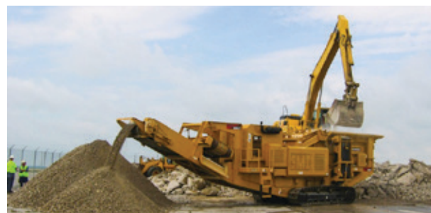
Crushing machine being loaded with construction debris by an excavator

Respiratory protection is not required for crusher operators regardless of task duration.