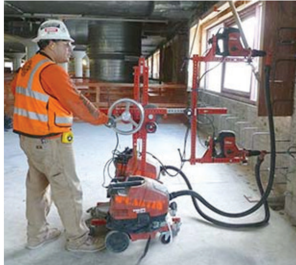
Worker is drilling horizontal holes in a concrete wall using two stand-mounted drills, each equipped with a dust collector. Note the shrouds around drill bits, black hose, and dust collector are attached to the stand.

Respiratory protection is not required when using handheld or stand-mounted drills equipped with a dust collection system, including for overhead drilling, regardless of task duration.