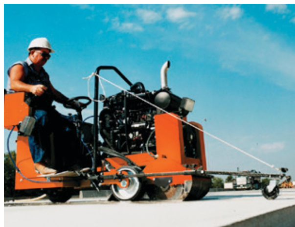
Worker cutting a groove in concrete roadway with drivable saw using integrated water delivery system.

Respiratory protection is not required for work with drivable saws regardless of task duration.