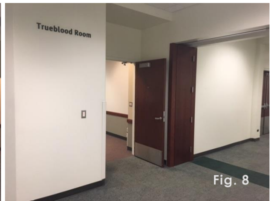
Exhibition Walls SW-Adjacent to the Accent Wall (orange triangle marks the same wall as in Fig. 5)