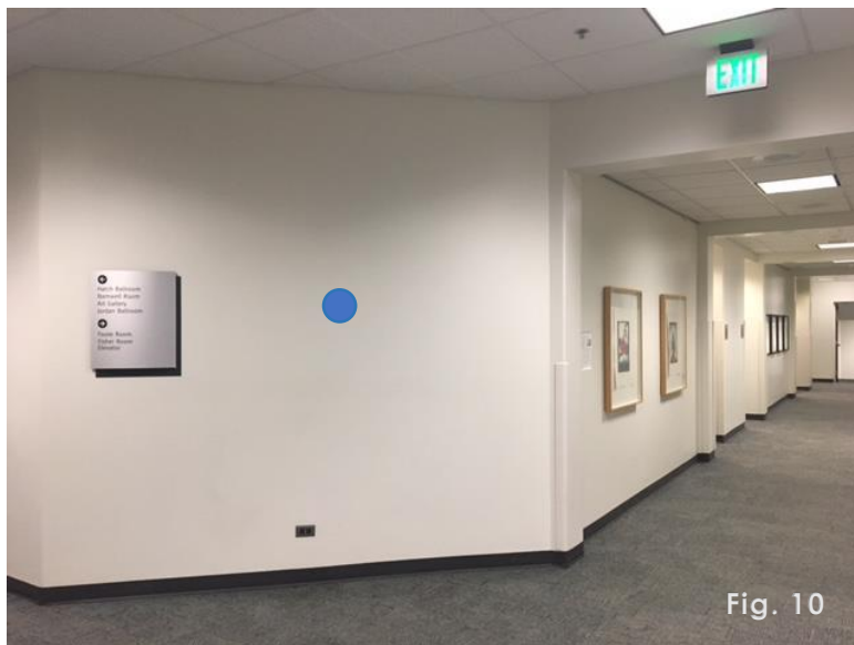
Exhibition Wall NW-Adjacent to the Accent Wall (blue dot marks the same wall as in Fig. 5)