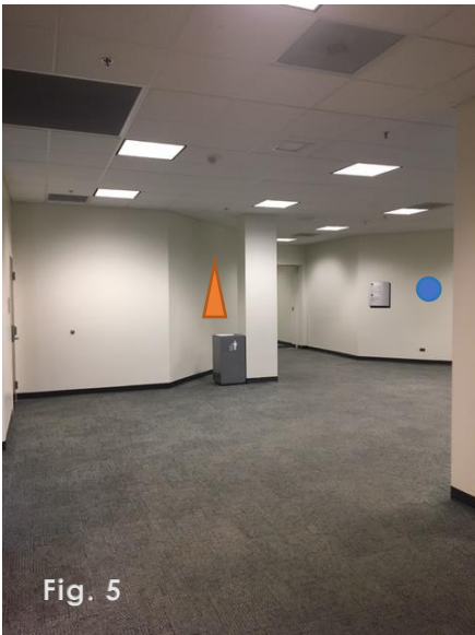
Open floorway of the gallery as seen approaching from the east